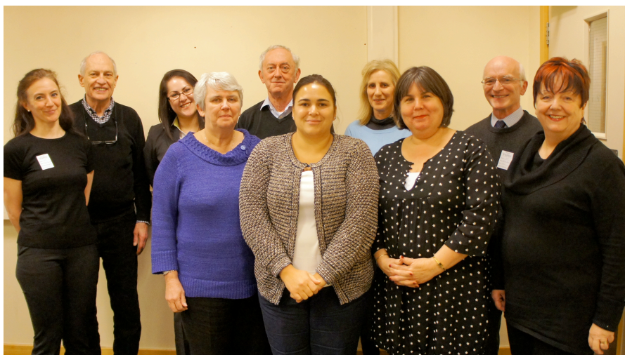
The TCT meeting in February 2014.

The current Chair of the TCT from the Copers Cope Residents' Association said, "Local groups and stakeholders have been very supportive of the TCT, we have representatives from a variety of local groups who are all keen to roll their sleeves up to take forward ideas and get things done in Beckenham. The Team is small, but the reach is wide, as each representative feeds back to their own organisation, this gives us a wealth of ideas and resources. We are especially pleased to be working with Waitrose who have offered their Community Volunteer Scheme for TCT projects and provided us with a meeting space. Now the TCT is in full swing you can expect to hear more from it."