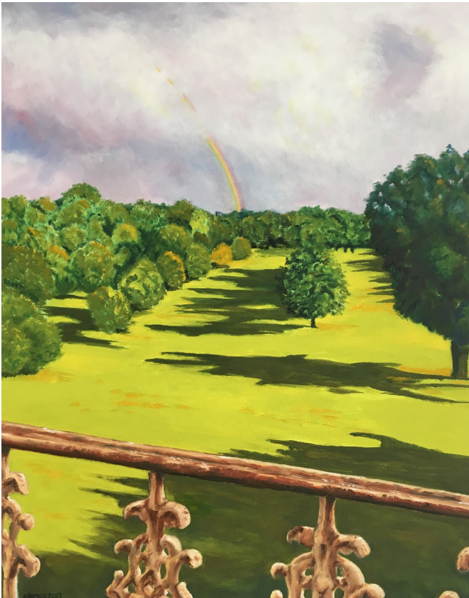
After the shower in Beckenham Place Park by Glenys Crane